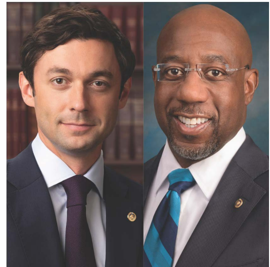
Sen. J. Ossoff

Overall, the new micro-transit system is expected to provide Chatham County residents with a new, affordable transportation option that will enable them to access critical services and employment opportunities more easily. Through the bipartisan infrastructure law, lawmakers hope to continue delivering investments that will strengthen Georgia's infrastructure and promote stronger connectivity and safer communities.