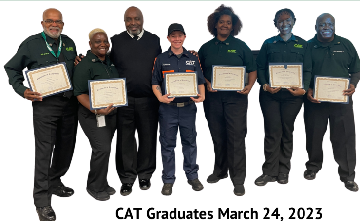
CAT Graduates March 24, 2023

Fixed-Route starting pay has increased to $20/hour Paratransit starting pay has increased to $15/hour