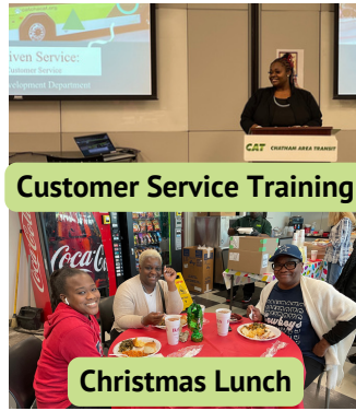
Customer Service Training