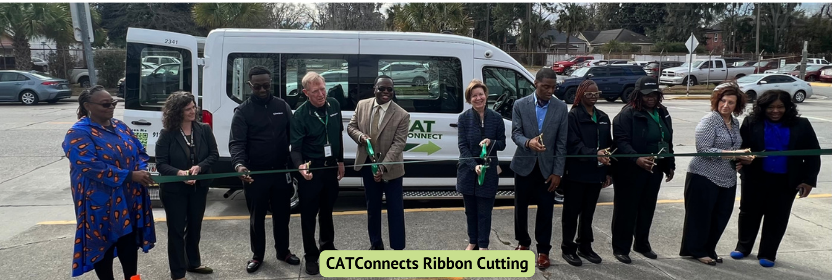
CATConnects Ribbon Cutting