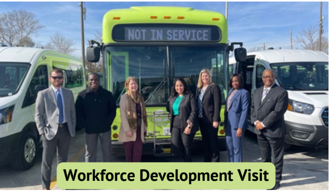
Workforce Development Visit