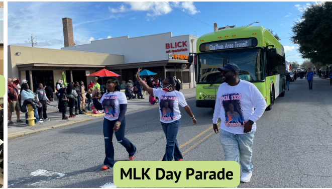
MLK Day Parade